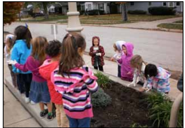
This fall our kindergarten students helped beautify our elementary entrance gardens by planting tulip bulbs. Next spring, please stop by and see the kindergarten students gardening skills. Our elementary PTA formed a committee that has been weeding and planting in the garden areas in front of our elementary office. Thank you!