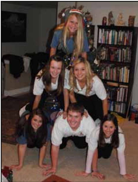
NM Choir Caroling In early December, the NM Choir Council went caroling at Christian Care Nursing Center and then had their annual holiday party which was a great evening of service and fellowship.