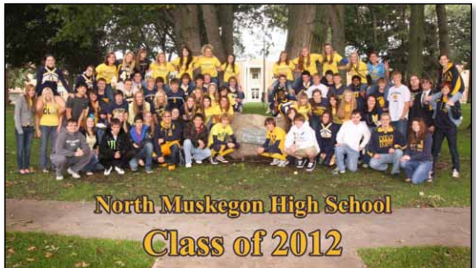
North Muskegon Public Schools proudly recognizes the senior graduating class for 2012.

As we build our school’s endowment with yearly gifts, we hope also that you will consider naming the North Muskegon Education Foundation as a beneficiary in your estate plan or IRA. You will leave a legacy of strength and quality for the future! Go Norse!